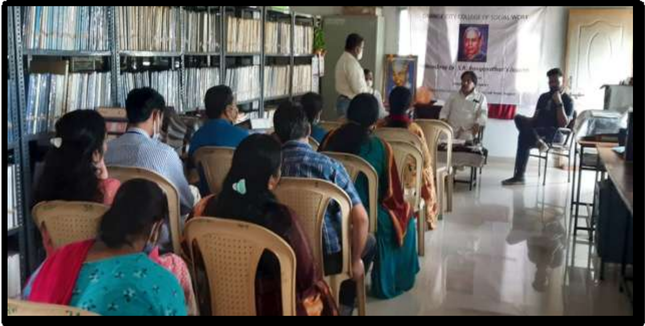
All Staff members with portrait of Dr. S. R. Ranganathan