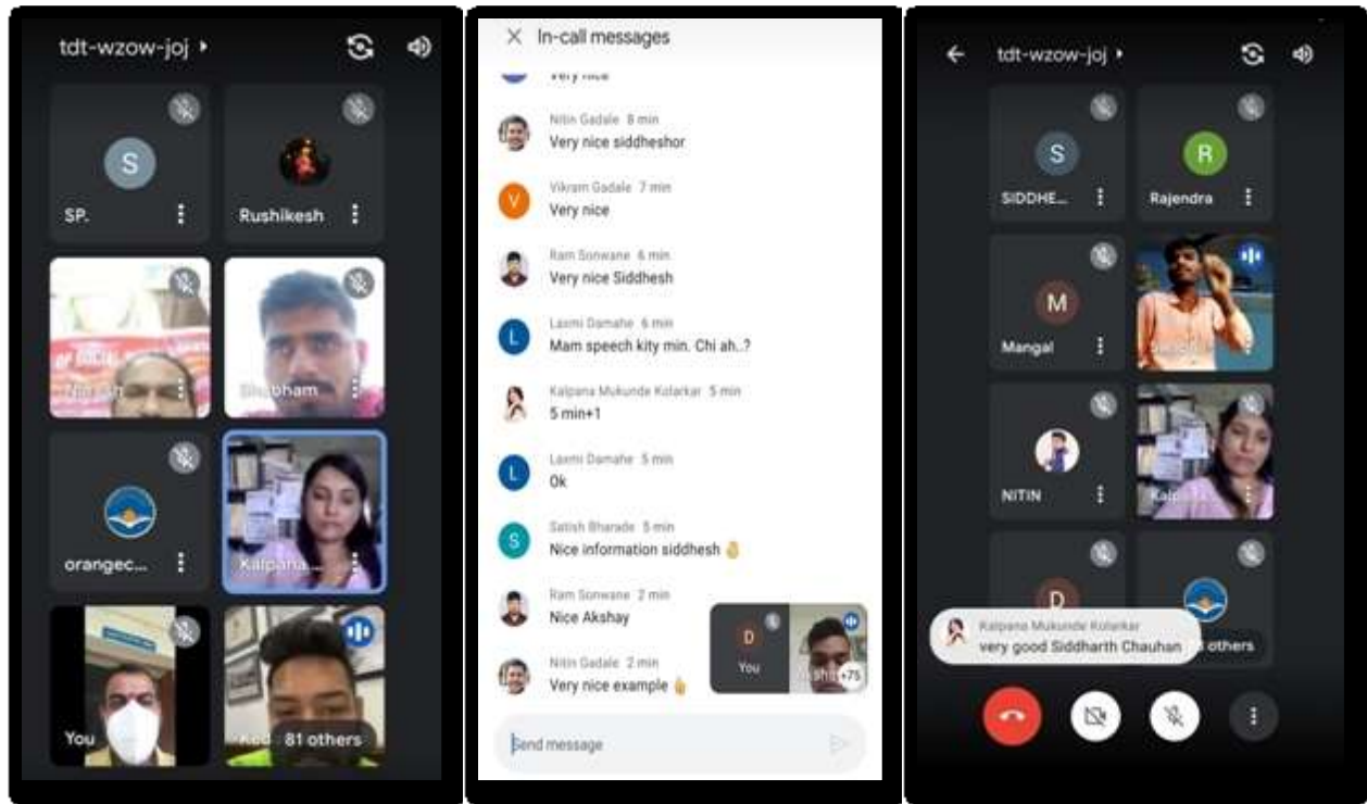
Screenshots of the Program

One day Workshop on Towards a Safer Digital Space for Women